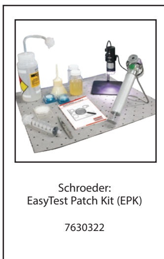
Schroeder: EasyTest Patch Kit (EPK)